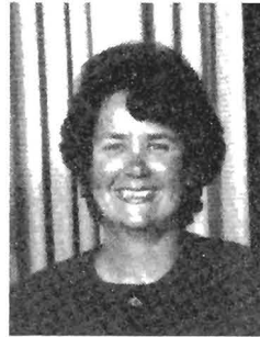
District Attorney Fifteenth Judicial Circuit of Alabama

Montgomery County Courthouse 251 South Lawrence Street P.O. Box 1667 Montgomery, AL 36102-1667 Phone: (334) 832-2550